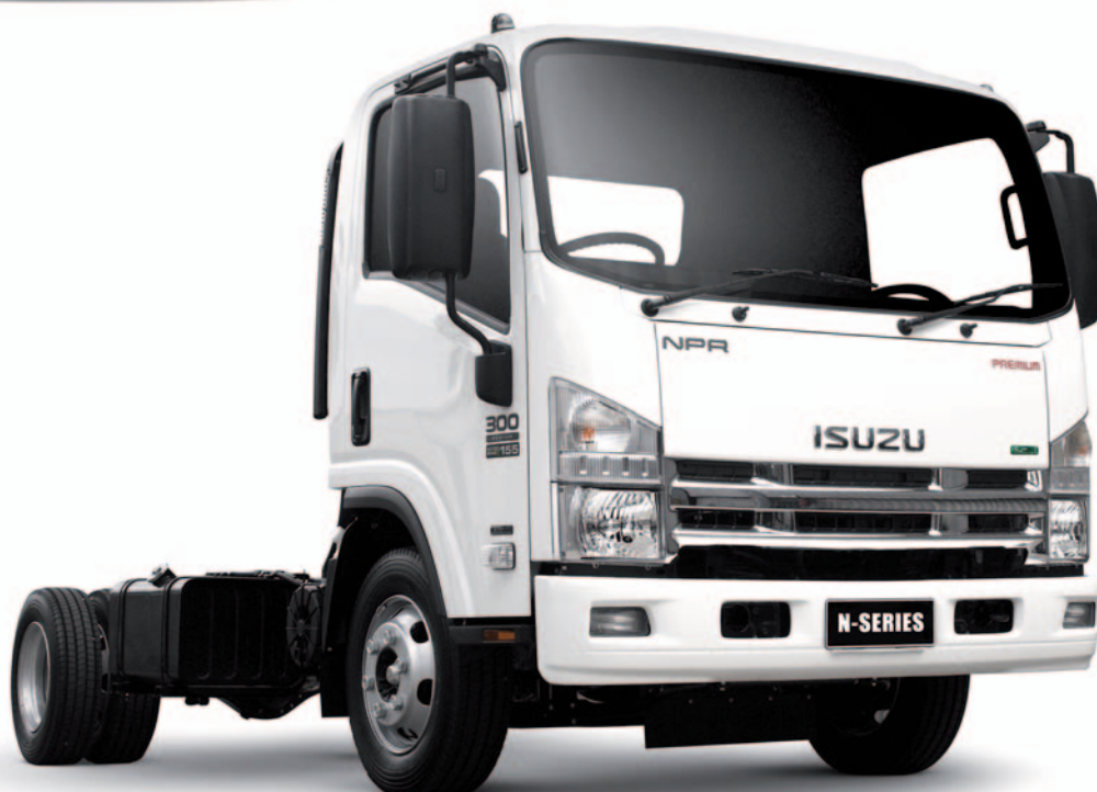
NPR 300 Premium

AUSTRALIA'S TOP SELLING TRUCK BRAND SINCE 1989.