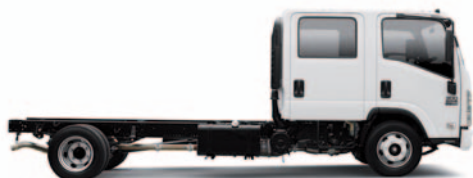
NPR 300 Crew