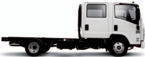
NNR 200 Crew