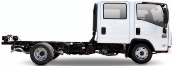
NLS 200 Crew