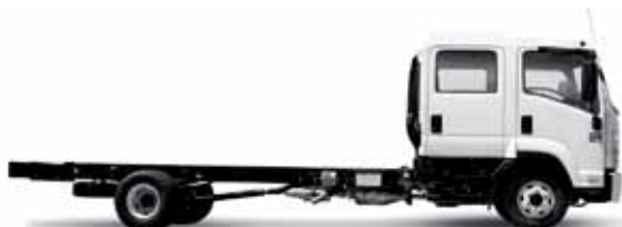
FRR 600 Crew